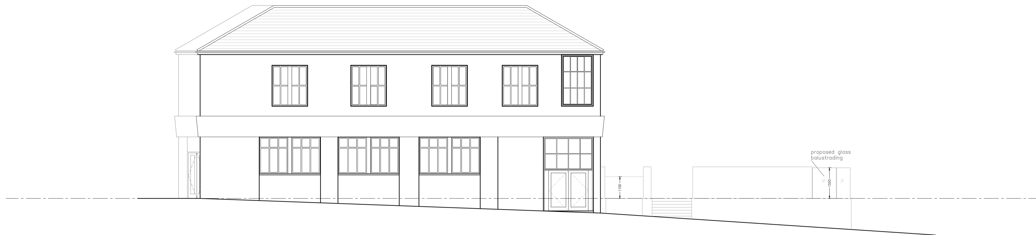
PROPOSED MILE END ROAD ELEVATION