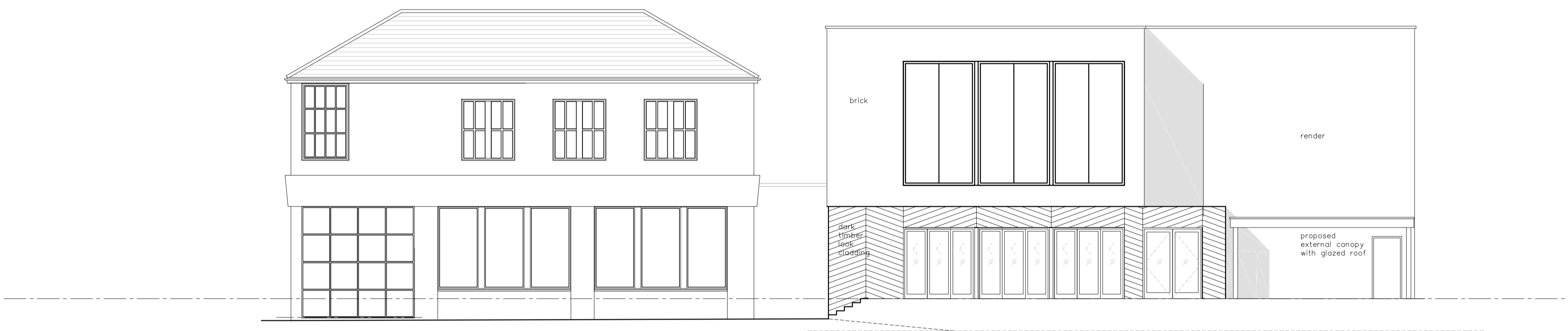
PROPOSED BRIGHAM PLACE ELEVATION _from proposed external dining