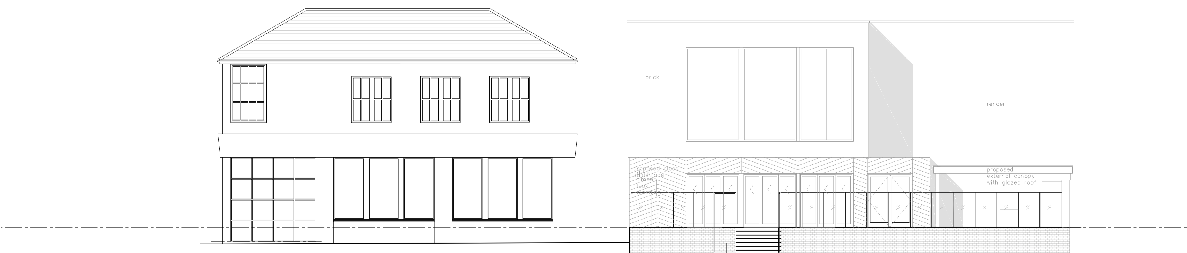
PROPOSED BRIGHAM PLACE ELEVATION